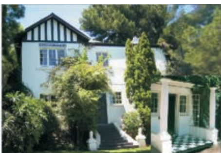
HANS SIMONSEN (ACCORDING TO OWNER) c.1920 14 ST JOHN ROAD (St John Road enclave excluded from the central region)