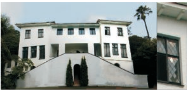
NELLY EDWARDS 1938 38 HOUGHTON DRIVE (HOUSE FRIEDMAN) (interior following page)