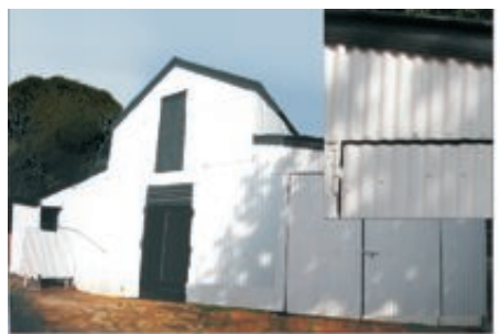
FRANK FLEMING 1912, 8 PINE STREET (STABLES AND COACH HOUSE FOR E FAIRBRASS, MASTER AT ST JOHNS COLLEGE)

The survey found 97 properties to be significant (HPF value 0.31) of which some 20 properties (6% of the total No. of properties in UH) do not fall within the area defined as the central region of cultural significance.