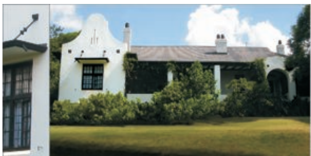
THEO SCHAERER 1911 1 ST JOHN ROAD (Sanlam Island excluded from the central region)